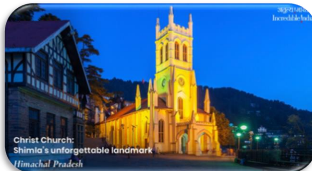
Christ Church: Shimla's unforgettable landmark Himachal Pradesh

popular in winter, when a blanket of snow covers it. An ideal getaway to experience thrilling and adrenaline-pumping sports like skiing, trekking, paragliding and ice skating. Almost perfectly preserving its legacy, as the erstwhile summer capital of the British in India, Shimla is dotted with sprawling colonial bungalows and is also renowned as the official retreat of the President of India.